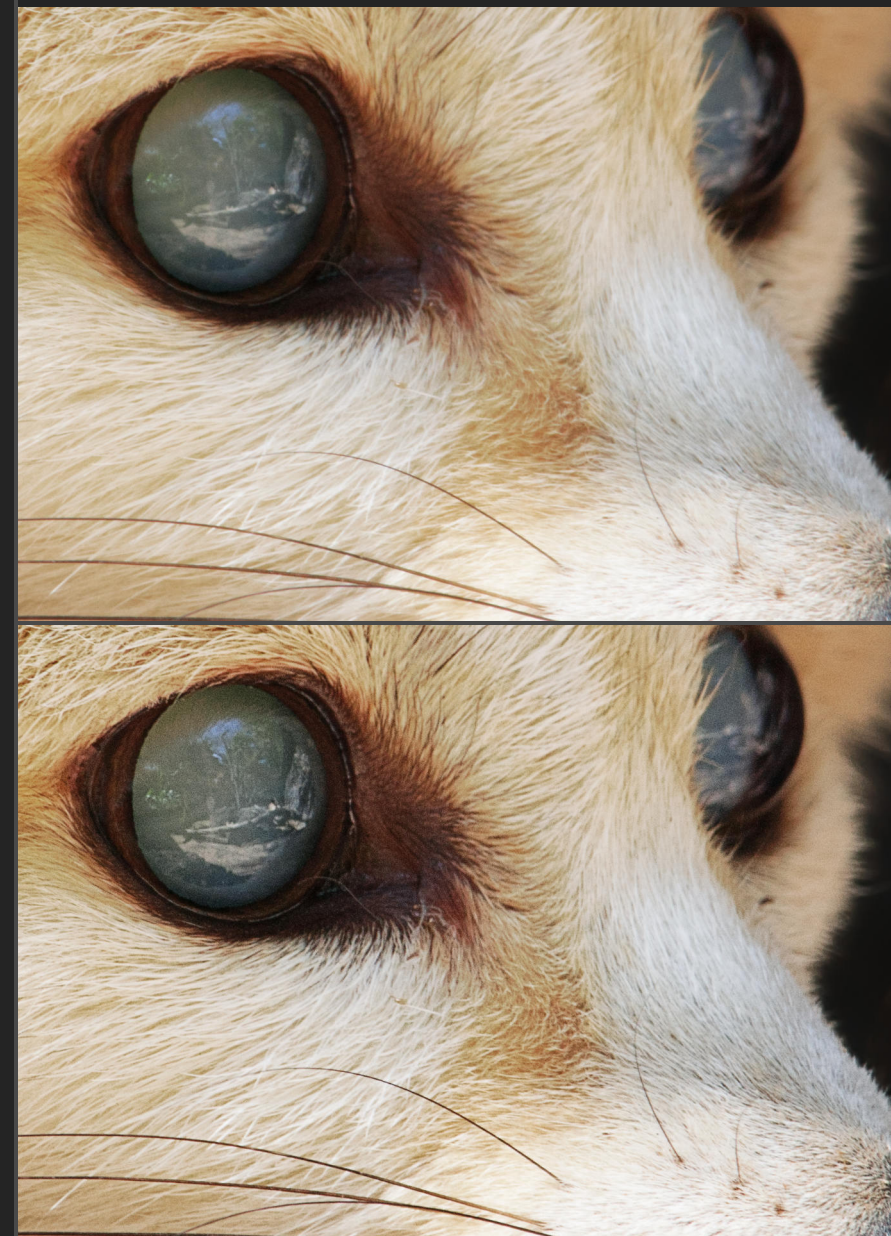
Top: No Sharpening. Bottom: Bandpass Sharpening (Regular)

Tip: you can also drag-drop the .afmacros file onto a blank area of the app and it will immediately import and be shown on the Library panel. You can bulk import multiple .afmacros files this way.