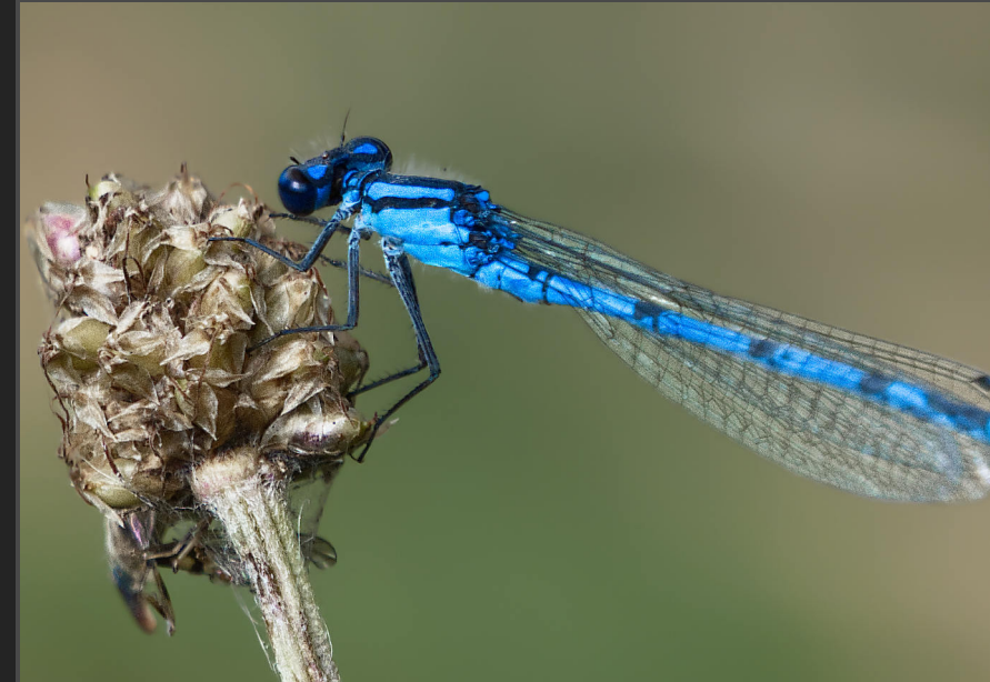
Top: No Sharpening. Bottom: Bilateral Sharpening