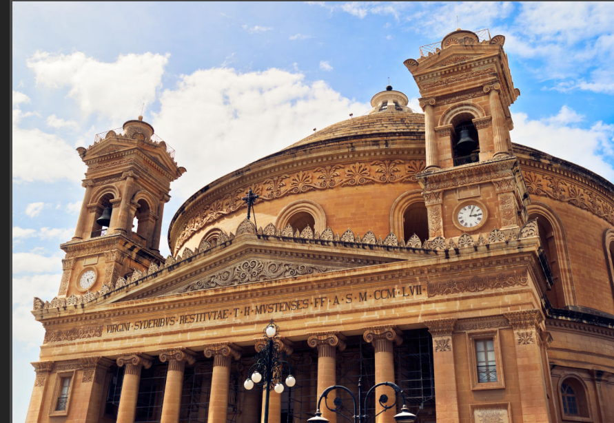
Top: No Sharpening. Bottom: Enhance Local Contrast