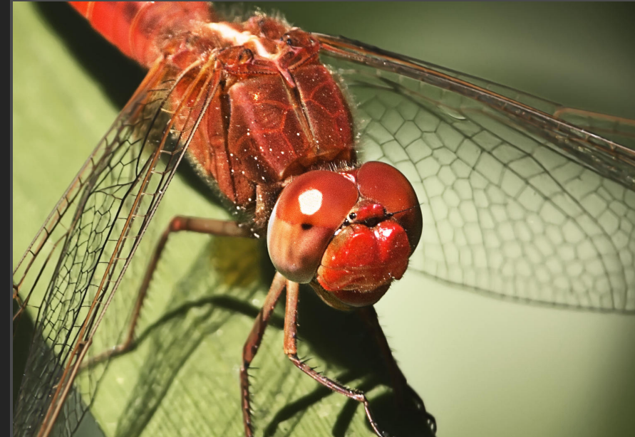
Top: No Sharpening. Bottom: Bandpass Sharpening (Fine)